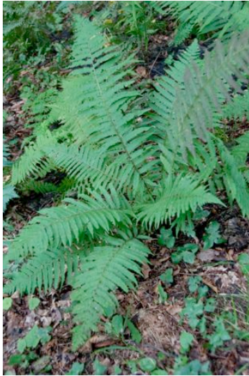
Marginal Woodfern at stop 3.