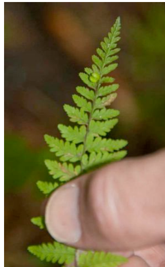
Bulblet Fern at stop 3. Note bulblet at top.