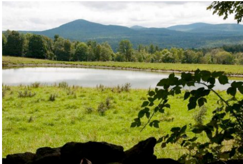
View to the east of the Knox Mt. Granite Pluton from stop 2.

4) Thick Surficial Deposits on the Winooski River Plant communities that grow in soils derived from Pleistocene clays and sands of Glacial Lake Winooski. This site was ideal for summarizing the successional plant communities that develop in a former pasture. The severe erosion of the high banks of the Winooski River that occurred during severe storms during the last 2 years (May and August of 2011) was also emphasized. Plants such as Goldenrod, Wild Carrot, and Willow shrub were observed.