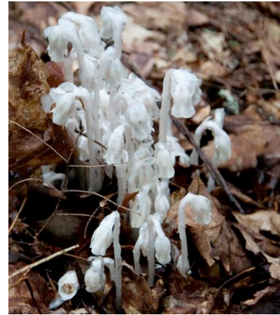
Indian Pipes at stop 3.